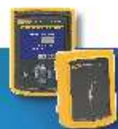
TNT 12000 X-Ray Test Device

©2008 Fluke Biomedical. 6/2008 3354630 T-EN Rev A