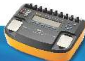
Impulse 1000DF Debrillator/ Transmittance Photometer Analyzer