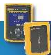
TNT 12000 X-Ray Test Device

©2008 Fluke Biomedical. 6/2008 3354630 T-EN Rev A