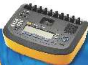
ES5820 Electrical Safety Analyzer

Designed by you. Engineered by Fluke Biomedical.